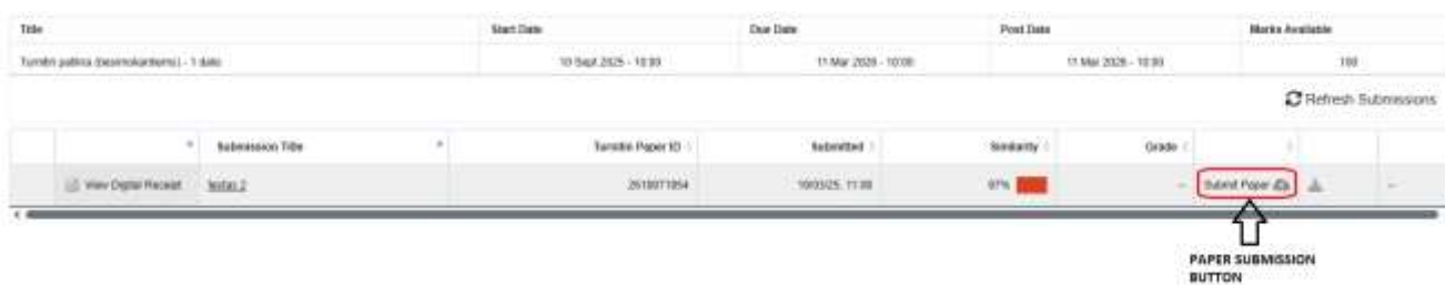
Figure 3. Work submission for text similarity check

All written works uploaded to the Turnitin Assignment are checked automatically. After submitting your written work, you will receive a notification that the file has been uploaded successfully to the Turnitin system. Simultaneously, Turnitin begins generating a Similarity Report in the corresponding Assignment (marked as 'pending'), which will contain details about whether you have properly cited and referenced the sources used in your paper. The Report shall be generated within 2 minutes. If the lecturer allows to resubmit an Assignment (for example, after completing necessary corrections), a new Similarity Report will be generated upon resubmission. The Report for an Assignment is generated immediately for the first three (3) times, and for the fourth and subsequent times the report is generated within 24 hours.